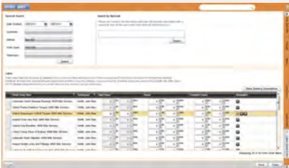
LABOR QUICK ENTRY: Use a stopwatch feature to track and record how long technicians are working on work order items. Quickly track multiple technicians at one time and manage breaks and work that is being done.

Servicefinder provides you with a comprehensive fleet management program for your vehicles, parts, inventory, and work orders.